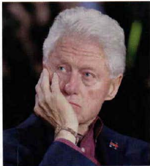
Former President Bill Clinton