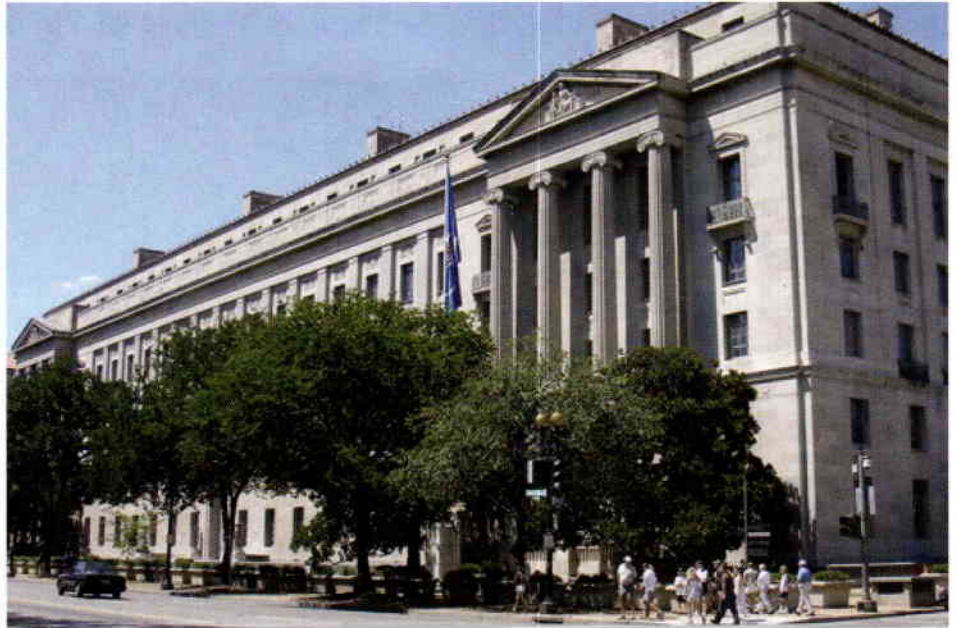
U.S. Department of Justice, Washington, D.C.

Watch v. U.S. Department of Justice (No. 1:19-cv-00388)). Additionally, the lawsuit seeks all recordings made by any official in the Office of the Attorney General or Deputy Attorney General of meetings in the Executive Office of the President or Vice President.