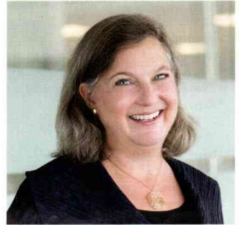
Former Obama Assistant Secretary of State Victoria Nuland

the secretary of state needed to be made aware of this material.”