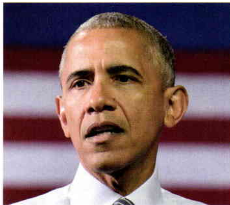
President Barack Obama

In December 2018, Judicial Watch released documents revealing that Nuland was involved in the Obama State Department’s urgent gathering of classified Russia-investigation information and disseminating it to members of Congress within hours of Donald Trump’s taking office.