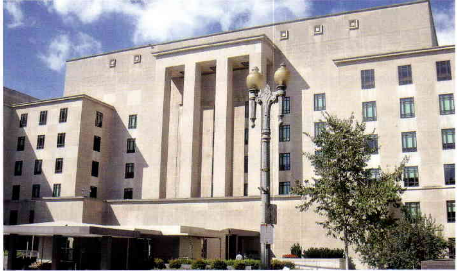
U.S. State Department, Washington, D.C.

“The Obama State Department was central to the effort to target President Trump with the Russia smear,” said Judicial Watch President Tom Fitton. “These new emails fur-