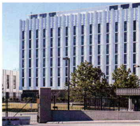
Russian Embassy, Washington, D.C.

Judicial Watch uncovered State Department documents showing that Winer played a key role in facilitating Steele's access to other top government officials and prominent international business executives. Winer was even approached by a movie producer about making a movie about the Russia-gate targeting of President Trump. In September 2019, Judicial Watch released State Department documents revealing that former British spy and