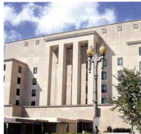
U.S. State Department, Washington, D.C.