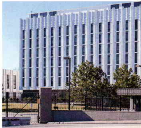
Russian Embassy, Washington, D.C.

Judicial Watch uncovered State Department documents showing that Winer played a key role in facilitating Steele's access to other top government officials and prominent international business executives. Winer was even approached by a movie producer about making a movie about the Russia-gate targeting of President Trump. In September 2019, Judicial Watch released State Department documents revealing that former British spy and