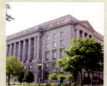
IRS Headquarters, Washington, D.C.