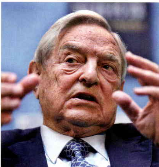
George Soros

USAID website reports it gave $4,819,125 in taxpayer money to Soros's Open Society Foundation-Macedonia from 2012 to 2016