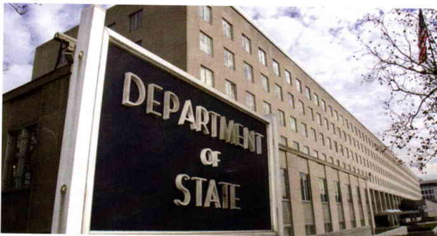
U.S. Department of State Headquarters Building, Washington, D.C.

“The Obama administration seemed to bust taxpayer budgets in an effort to fund the Soros operation,” said Judicial Watch President Tom Fitton. “The Trump State Department and USAID should get their act together and disclose the details of the Obama-Soros spigot.” JW