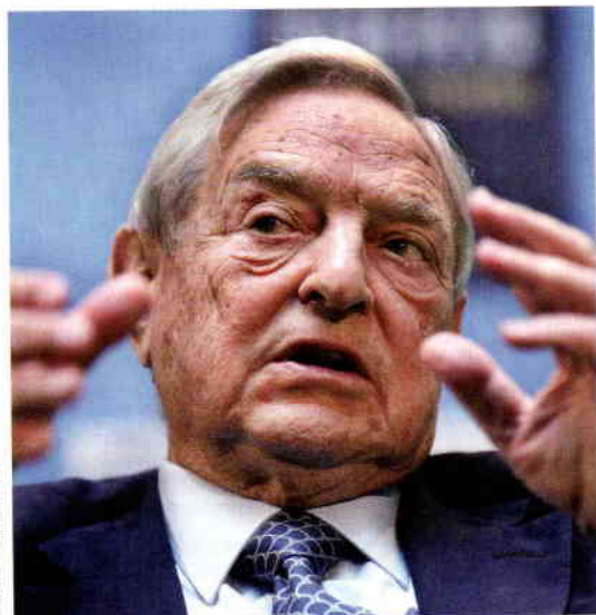
George Soros

USAID website reports it gave $4,819,125 in taxpayer money to Soros’s Open Society Foundation–Macedonia from 2012 to 2016