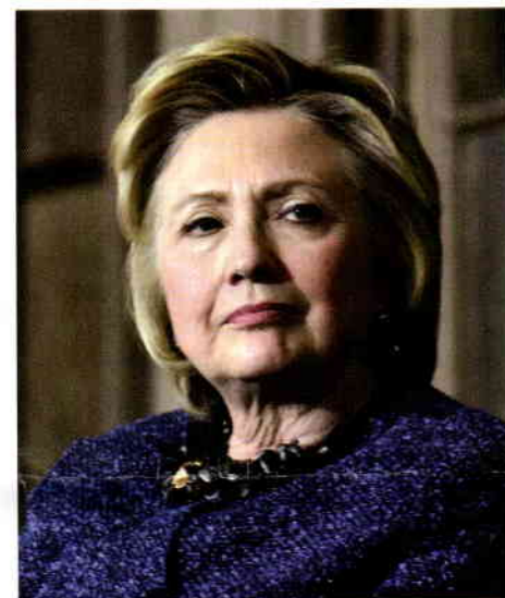
Hillary Clinton