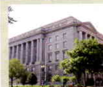
IRS Headquarters, Washington, D.C.